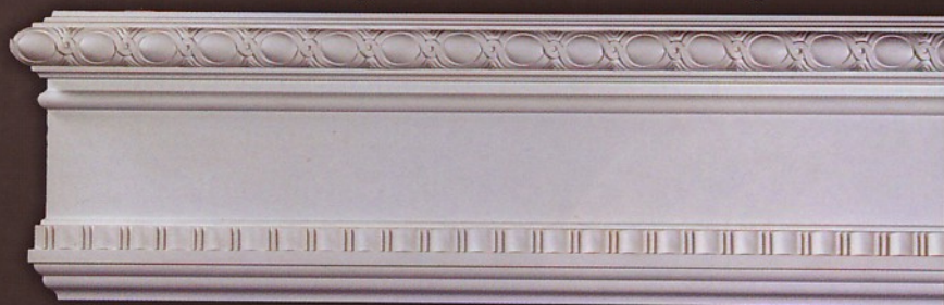
WR-9106 Molding • 9 3/8" H x 1 3/4" W x 96" Long