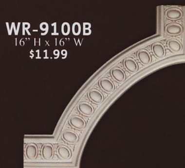
WR-9100B 16" H x 16" W $11.99