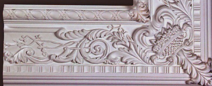
WR-9106A 24" H x 24" W