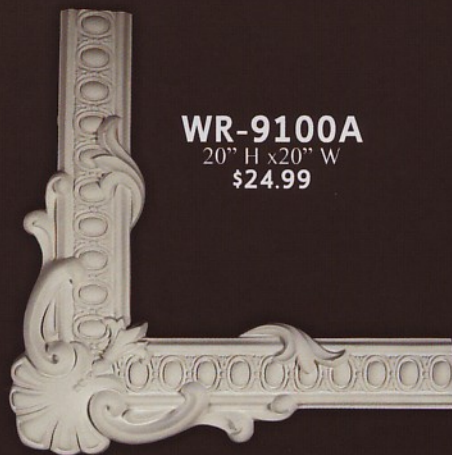
WR-9100A 20" H x 20" W $24.99