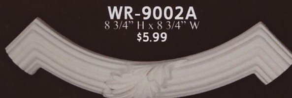
WR-9002A 8 3/4" H x 8 3/4" W $5.99